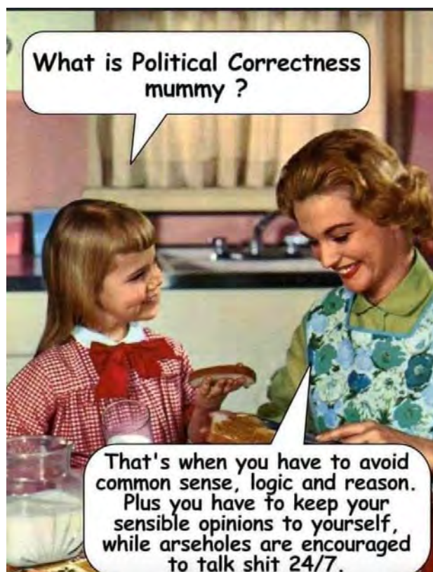
Satirical Humour aimed at Political Correctness

And the result, as we have seen, is a fundamental change in the nature, persona and character of the British people. Instead we have a population grappling every day with the lack of freedom of expression. We no longer have our traditional British satirical humour. On the sur-